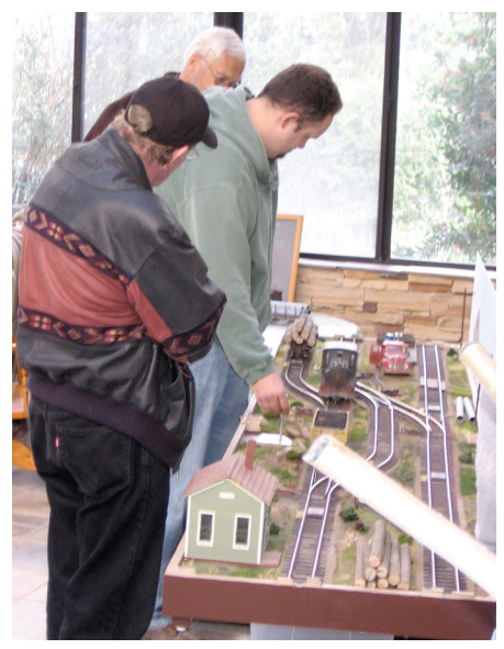
SLOMRRA's G-Gauge Time Saver being put to the test.