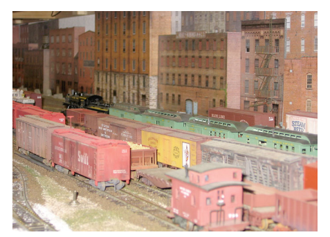
George Gibson's layout view across the urban staging yard.