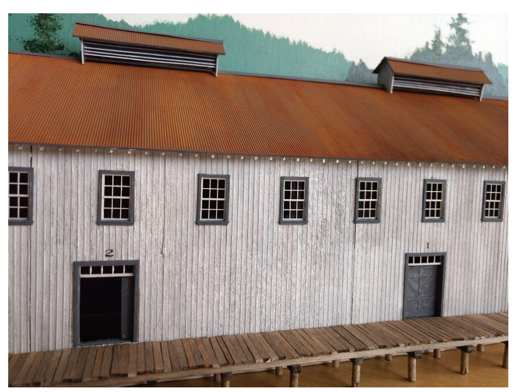
Continued on Page 8

March 31, 2012--149 March 31, 2021—103 April 30, 2021—101 May 31, 2021—100 June 30, 2021—98 July 31, 2021—100 August 31, 2021—96 September 30, 2021—97 October 31, 2021—97 November 30, 2021—97 December 31, 2021—95 January 31, 2022—93 February 28, 2022—92 March 31, 2022—92