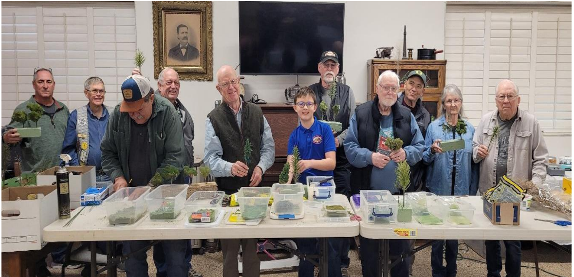
Success! Participants showcase their newly crafted trees, ready to enhance their layouts with realistic scenery.

After wrapping up the tree-making clinic, attendees switched gears to tackle another essential skill—soldering.