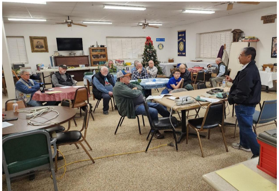
Soldering 101: Attendees receive expert tips on making strong, reliable soldering connections in their layouts.

Soldering is a fundamental skill in model railroading, essential for wiring layouts and assembling components. The hands-on clinic introduced attendees to key techniques, from tinning wires to creating durable joints. Participants had the opportunity to bring their own equipment, ensuring they left with practical, real-world skills.