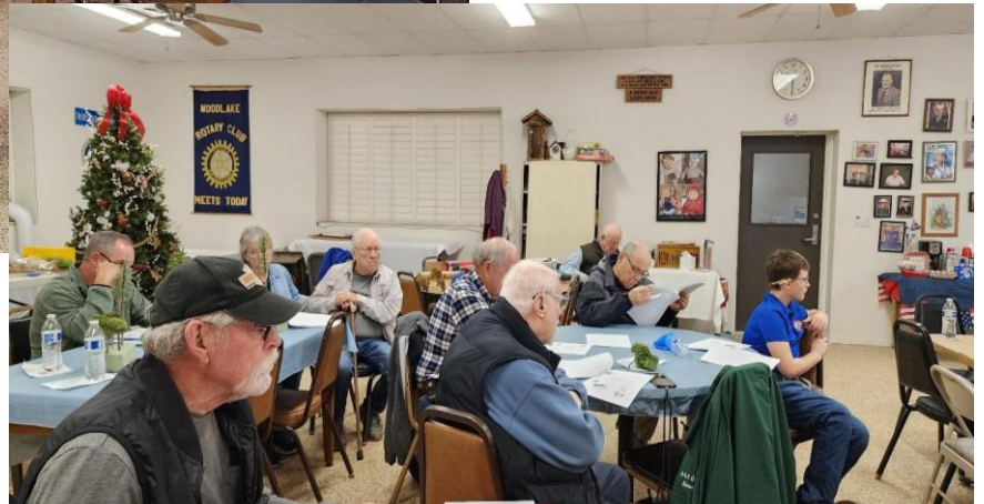
Enthusiastic participants jot down notes on crafting lifelike trees using affordable, everyday materials.