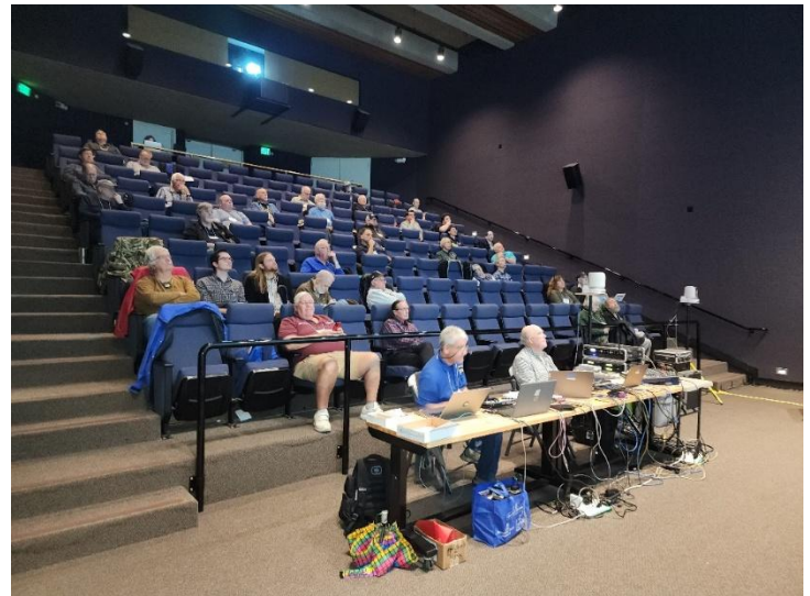
Clinic taking place at the 2025 Layout Design and Operations Weekend in the CSRM

The following morning, attendees met at the California State Railroad Museum for a day of clinics on a variety of topics. Information on both layout design and operations was covered throughout the day, culminating that evening with the opportunity to visit several of the area's outstanding local layouts.