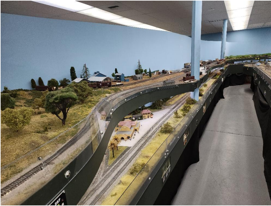
Sacramento Model Railroad Historical Society's HO scale layout

The Layout Design and Operations weekend concluded on Sunday with the opportunity to participate in a couple of operating sessions. Since this was only my third time at an operating session, I chose the session offered at the Sacramento Model Railroad Historical Society. As a larger HO Scale layout with multiple jobs and assignments, this choice would give me the ability to work within my skill level and to learn by observing the more skilled and experienced operators. I was not disappointed.