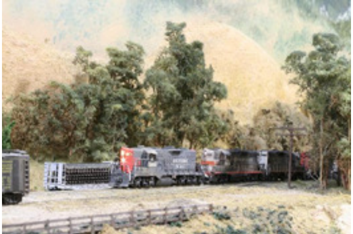
Here is an example of the great detailed work Charlie Burns has done in N Scale!