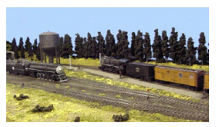
Steam action lives on Karl Kvilvang's Western Pacific layout

http://www.nmra.org/achievement/pdf/2006-golden-spike.pdf