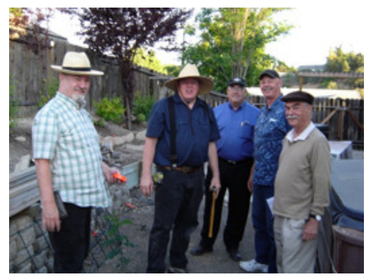
Now do these guys look like railroad surveyors?