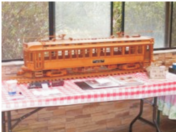
Ted VanKlaveren's beautiful very large scale model of Pacific Electric 101 won favorite model at SLO.